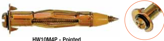
HW10M4P - Pointed